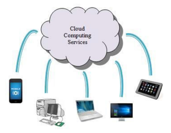
Figure-1 Cloud Computing Demonstration